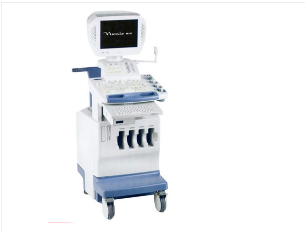
Digital Ultrasound Machine