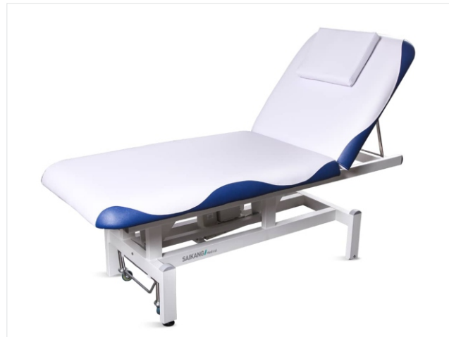
Patient Examination Bed