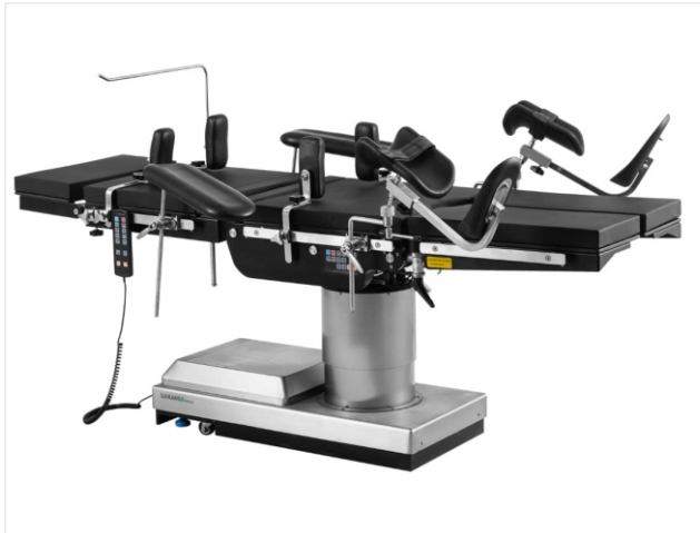
Fully Electric Operating Table