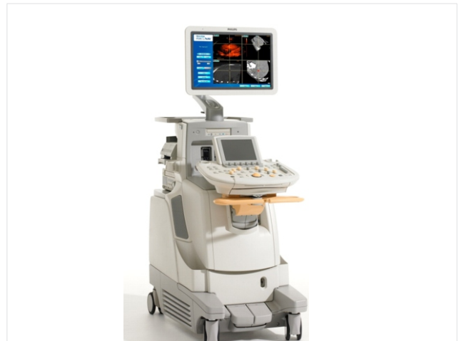
Digital Ultrasound Machine