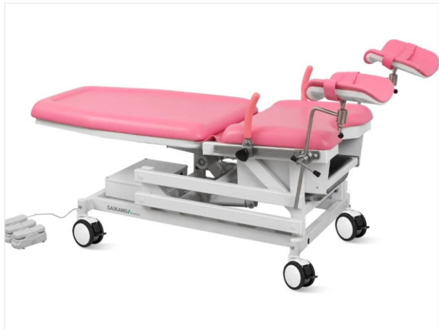
Electric Gynae Bed