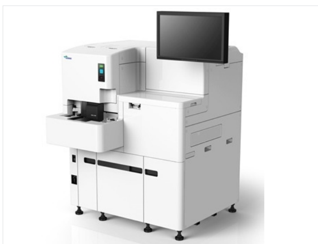
Fully Automated Tissue Processor