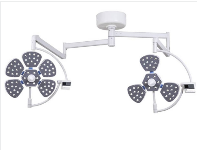
Ceiling Mount Operating Lamp