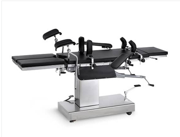
Manual Operating Table