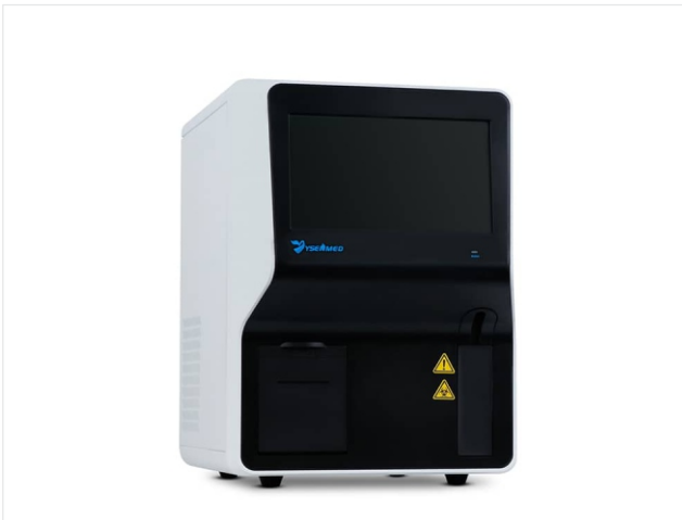
Fully Automated Haematology Analyzer