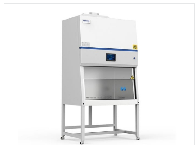
Bio Safety Cabinet