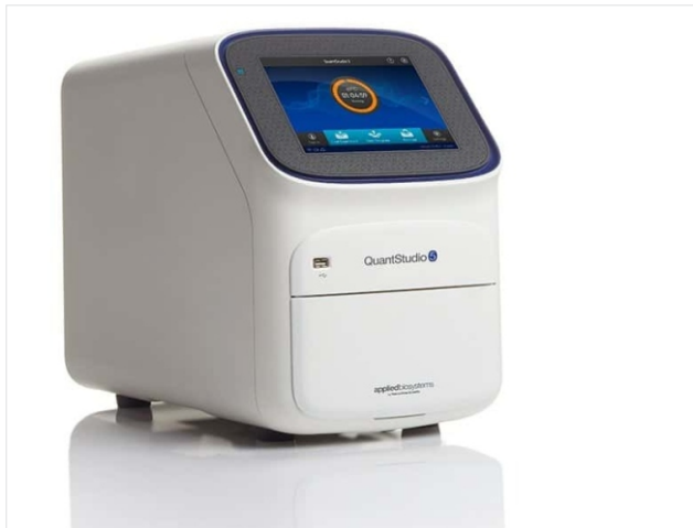
Fully Automated Immunology Machine