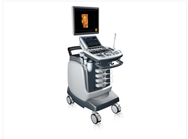
Digital Ultrasound Machine