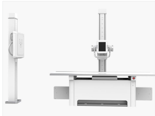
Static X-ray Machine