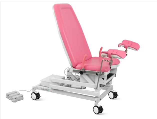
Electric Gynae Bed