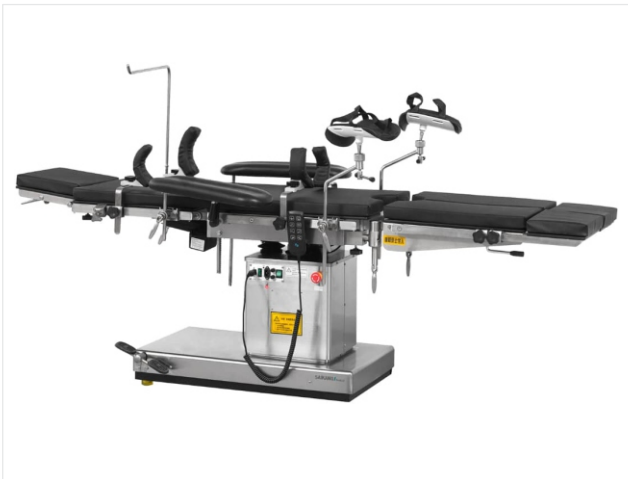
Fully Electric Operating Table