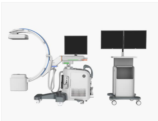
C-arm X-ray Machine