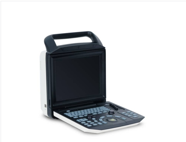
Portable Ultrasound Machine