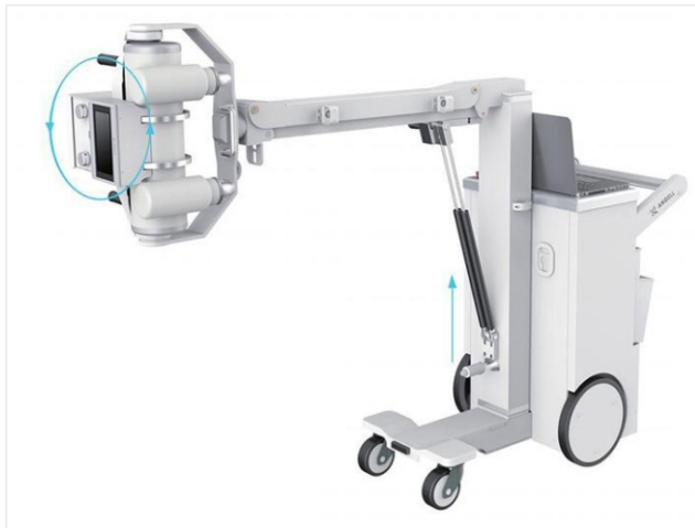
Digital Mobile X-ray Machine