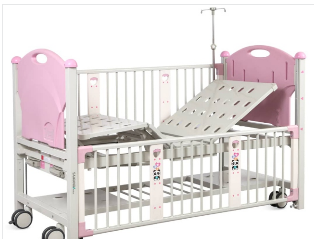
Electric Pediatric Bed