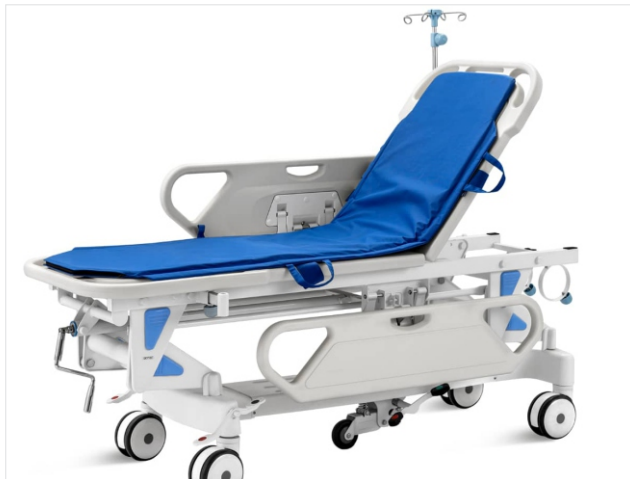
Patient Transfer Trolley