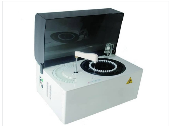
Fully Automated Chemistry Analyzer